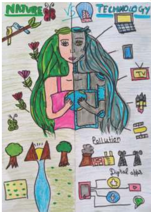
Pratyaksha (V Neptune)